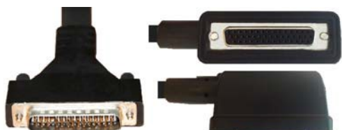
NEW PRODUCTS D-SUB STRAIGHT/ANGLED WITH MOULDED CABLE